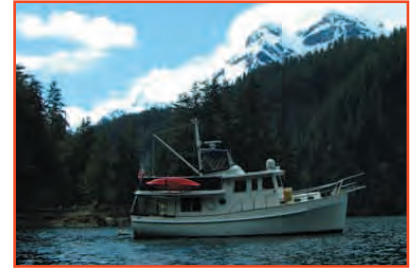
The Inaugural Voyage