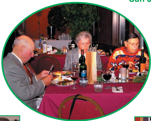
A Perfect Evening