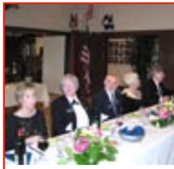
"The Head Table"