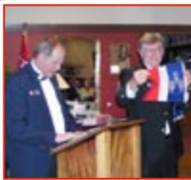
Exchange of Flags