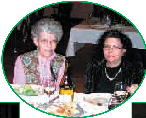
A Perfect Evening