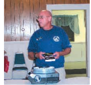
Galapagos Slide Presentation