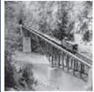
Canadian Pacific Railway

The peak of CPR steamship service was during 1930 but by the 1950's the fleet was in decline, a victim of changing society that was more and more wedded to the automobile, faster transportation, and a movement of populations to larger urban centers.