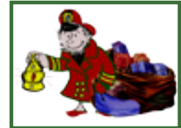
Naughty or Nice ???