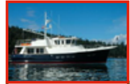
Circumnavigation of Vancouver Island 2005

At our November General Meeting, Brian and Sasha Calvert presented an entertaining and interesting photo tour of their seven-boat Selene circumnavigation of Vancouver Island. Their navigation and seamanship stories make us all glad we have the USPS to make us better and safer boaters. Thanks, Brian and Sasha!