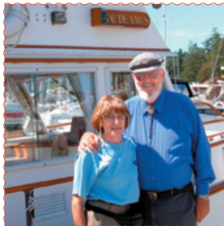
The Greever's Gaudeamus