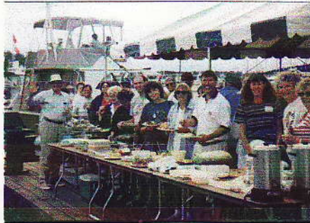
A motley crew indeed.

Both the Canadian and US Ensigns were displayed at Roche Harbor during our stay and were a part of the nightly flag ceremony