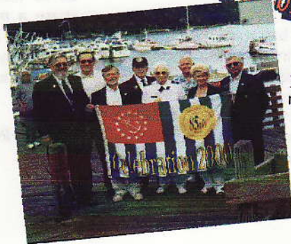
year's "mystery commander."

I am even collecting a whole new set of stories or jokes with the help of last